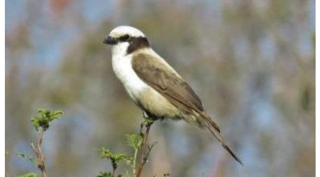
Southern White-crowned Shrike, Doreen's Pride

large Diospyros trees growing on the edge of the dam. It had been dead for several hours and was very obviously emaciated. The children had started removing its feathers and we are uncertain whether it had died from natural causes (starvation?) or had in fact been killed by somebody with a catapult. We froze the bird and it was taken to Harare for identification.