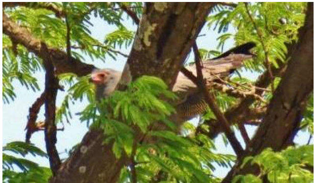
African Harrier-hawk, Kadoma

villages to water and graze couch grass growing on the dam periphery. Netting is a problem. Water is pumped into the Pasi from Claw Dam, thereby ensuring that the quality of the water is consistently good year round. A huge expanse of waterlilies covers most of the upper reaches of the dam – a breath-taking spectacle when in bloom!